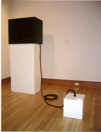
Above: Dislocation of Intimacy , 2004, Installation View, Cambridge Art Center